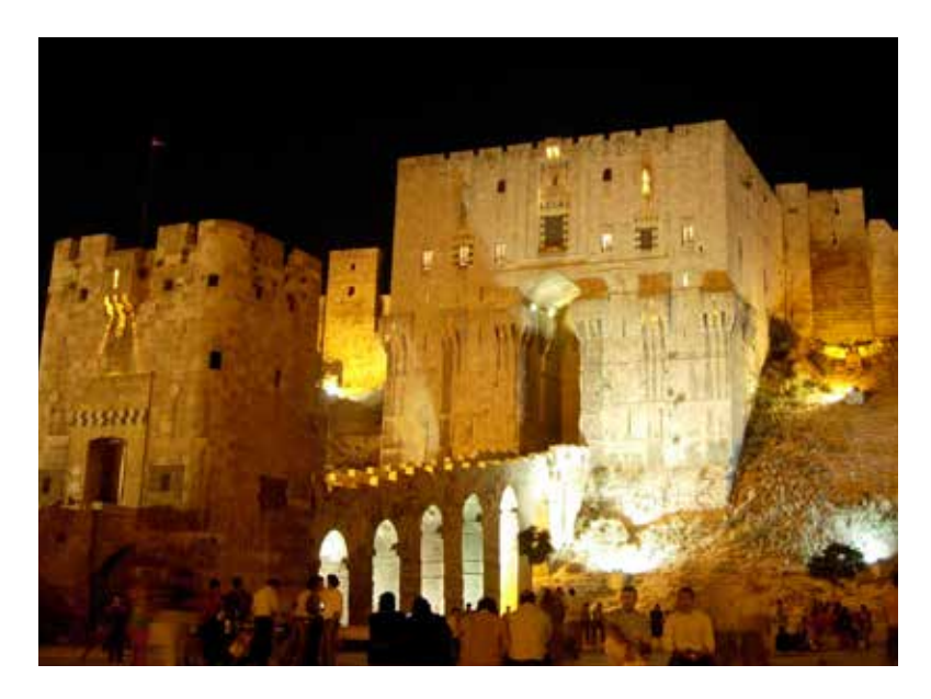
CITADEL OF ALEPPO, SYRIA

Hague Convention, protection of cultural heritage in times of conflict has deteriorated since World War II, and recent and ongoing cultural losses from destruction and looting in Syria have been notable for their severity. Escalating violence since 2011 has had devastating effects on some of its most significant and symbolic sites, including Aleppo, the Crac des Chevaliers, and the fortress of Qa'lat al-Mudique. This has