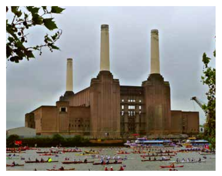
BATTERSEA POWER STATION. LONDON. ENGLAND

A number of other sites on the 2014 Watch face similar challenges: In the United Kingdom, three former industrial sites—Grimsby Ice Factory, Battersea Power Station, and Deptford Dockyard—indicate the potential to utilize obsolete industrial buildings as magnets for cultural and community development. In Monterrey, Mexico, the former industrial Fundidora Park was successfully converted into a public space, but its education center, horno3, previously a blast furnace, faces a lack of funds for maintenance and conservation. Other compelling examples