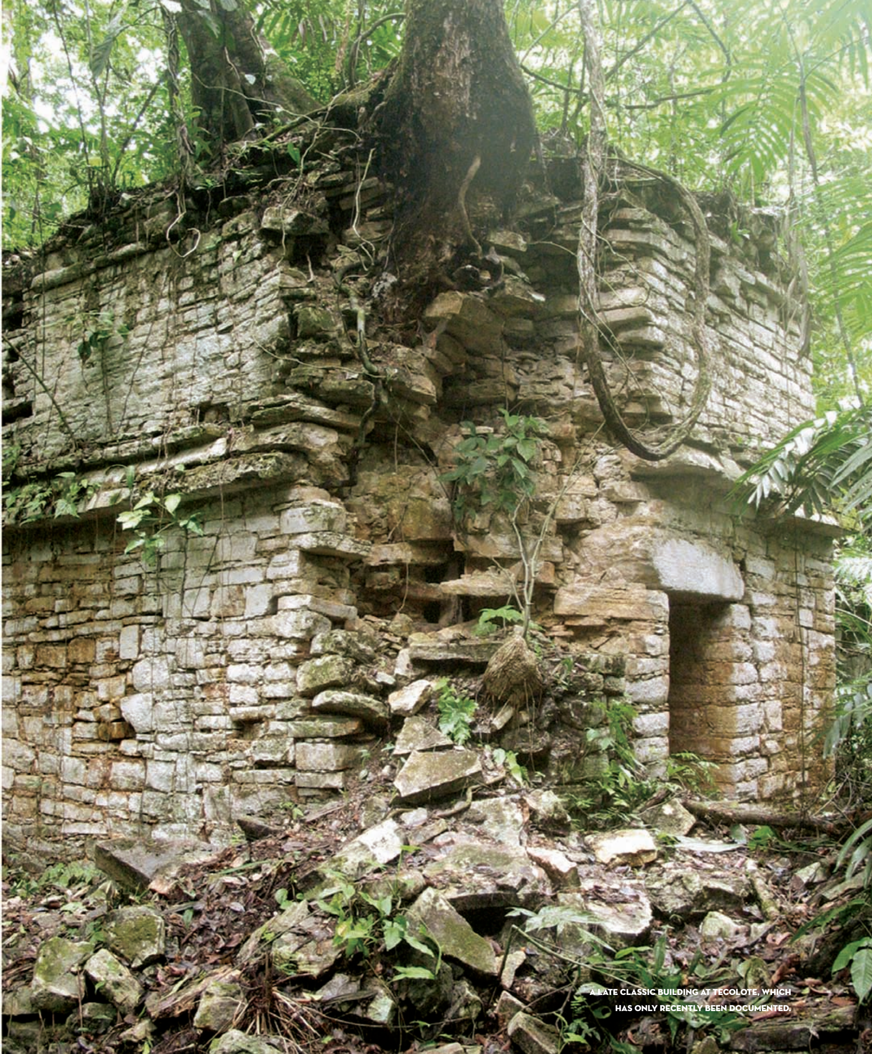
A LATE CLASSIC BUILDING AT TECOLOTE, WHICH HAS ONLY RECENTLY BEEN DOCUMENTED.