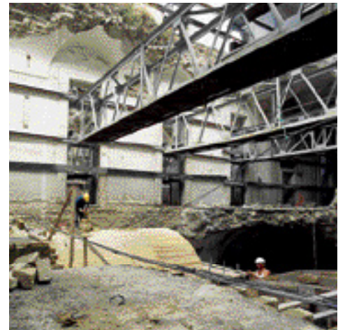
THE NEWLY RESTORED CENTRAL SECTION OF THE FRONT FACADE, TOP, AND ONGOING RESTORATION WORK, ABOVE.

Standing on the balcony of this vast, silent building, looking down over the bustle of historic and modern Naples with Mount Vesuvius in the distance, both the past and present are visible. History and continuity are important, and the Albergo's team is trying hard to advance this project with a firm grip on both while looking to the future. The legacy of King Charles III is an edifice that until now has been unfinished and out of sync with the city. He has left them a difficult task—but they are meeting it with sensitivity, care, and a grand ambition that matches Charles' own. ■