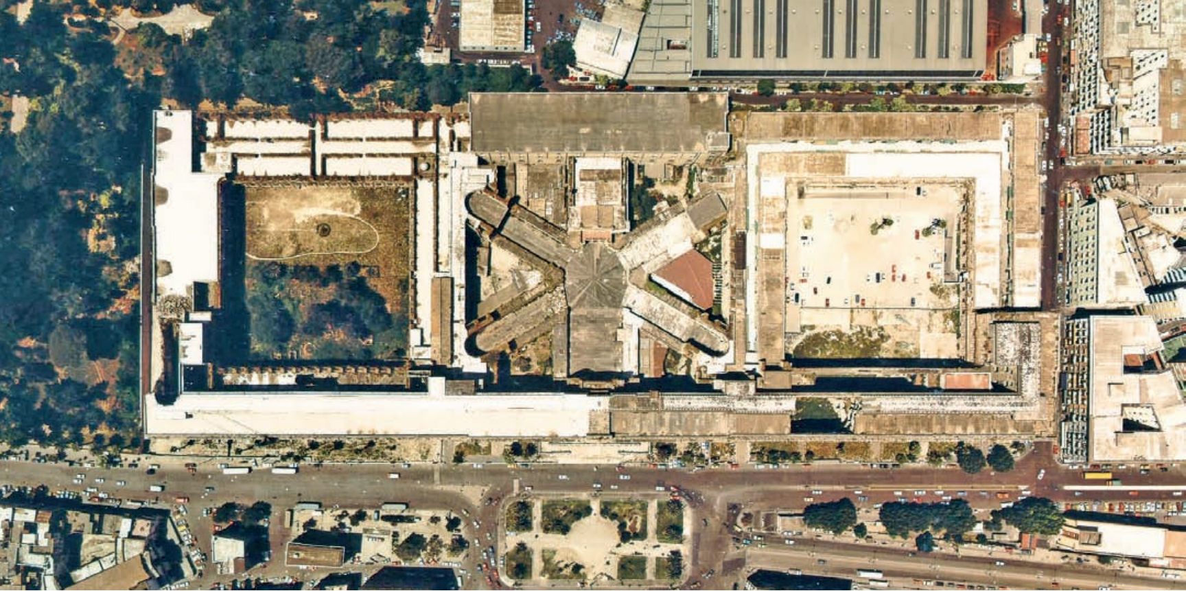
A BIRD'S-EYE VIEW SHOWING THE THREE PARTLY COMPLETED QUADRANTS, ABOVE, GIVES THE clearest SENSE OF THE PANOPTICON CHURCH PART CONSTRUCTED IN THE CENTRAL COURTYARD. THE GRAND SQUARE WITH RADIATING STREETS IN FRONT OF THE ALBERGO IS NOW ALL BUT CONSUMED BY NAPLES' ANARCHIC ROADS.

main city jail. Some were forced to go there. Others entered voluntarily and the Albergo did provide perhaps welcome relief for many of the city's beggars, invalids, and elderly. Residents worked either within the building or outside of it. Wages, however, were not provided; nor was choice. Charles' idea for an almshouse, although initially benevolent, effectively was that of a prison.