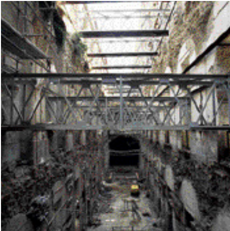
A CORRIDOR ON THE TOP FLOOR, TOP, HAS A NEW TIMBER ROOF. PARTS OF THE BUILDING, ABOVE, HAVE BEEN BRACED TO PREVENT COLLAPSE. RIGHT, VAULTS ARE UNDER CONSTRUCTION, FOLLOWING THE TIMELESS TECHNIQUES OF TIMBER VAULTING AND USE OF LOCAL VOLCANIC TUFA STONE.