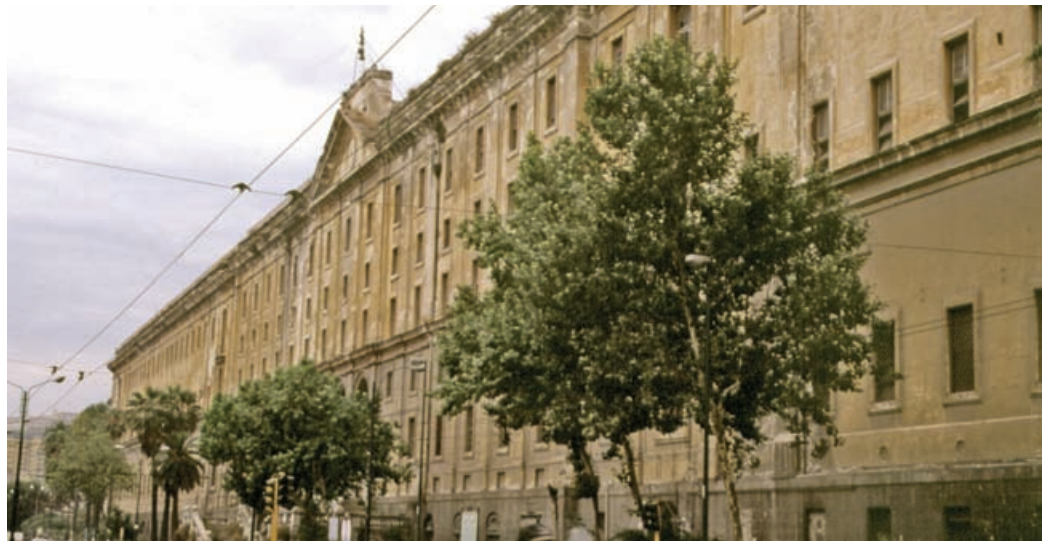
IMAGES FROM TOP LEFT CLOCKWISE: SEEN FROM THE COURTYARD, THE ONLY PUBLIC ENTRANCE TO THE ALBERGO. THE FRONT FAÇADE BEFORE THE CENTRAL SECTION OF THE EXTERIOR WAS COMPLETED. A VIEW OF THE CENTRAL COURTYARD. A NAVE OF THE PANOPTICON CHURCH.