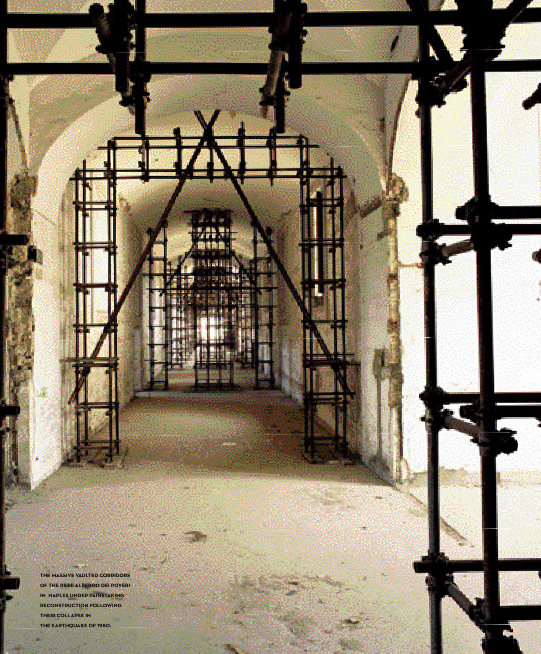
THE MASSIVE VAULTED CORRIDORS OF THE REAL ALBERGO DEI POVERI IN NAPLES UNDER PAINSTAKING RECONSTRUCTION FOLLOWING THEIR COLLAPSE IN THE EARTHQUAKE OF 1980.