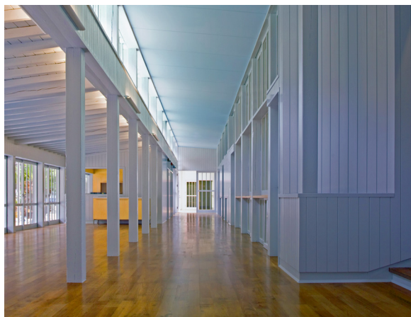
The 2012 winner was The Architectural Consortium for Hizuchi Elementary School, Yawahama City, Ehime Prefecture, Japan

The World Monuments Fund/Knoll Modernism Prize recognizes heroic efforts that preserve our modern heritage. Projects that enhanced a site's architectural, functional, economic, and environmental sustainability while also benefiting the community are encouraged. Nominated projects must have been completed in the last five years.